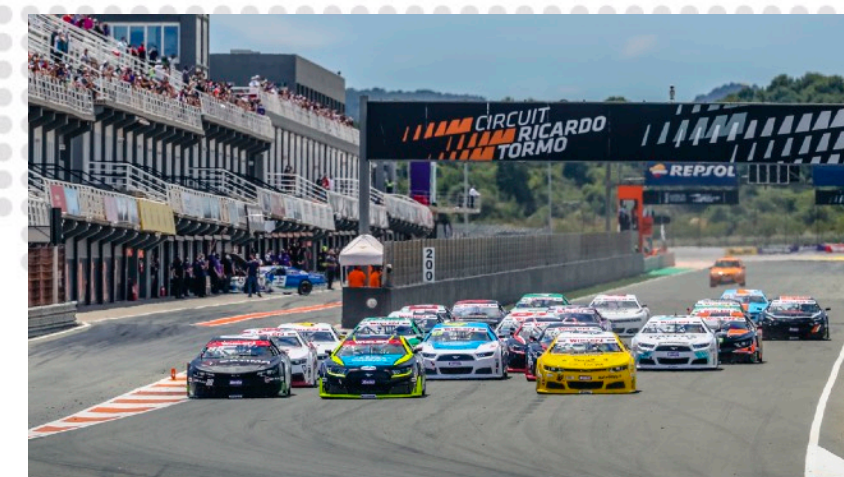
Circuit Ricardo Tormo

3,6 Km Road Course | Hockenheim, Germany